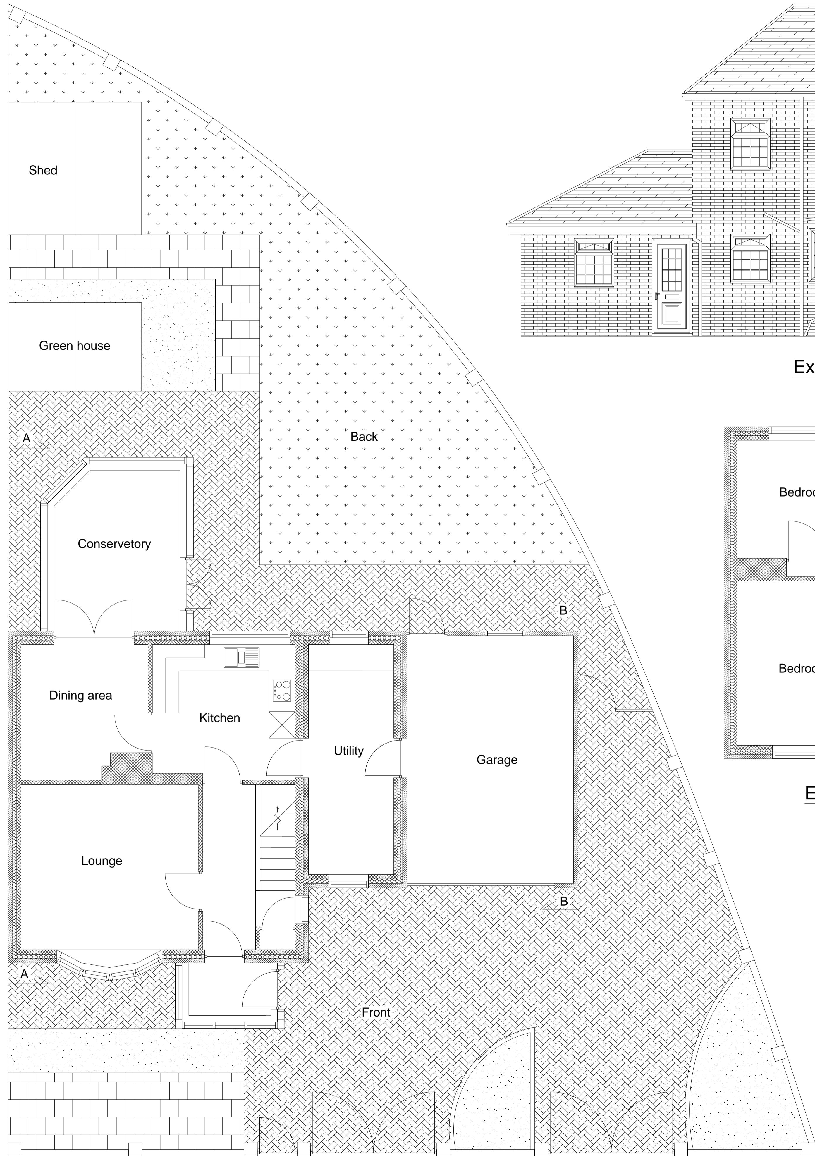
Existing Ground Floor Layout